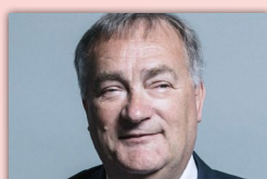
Nick Brown Chief Whip