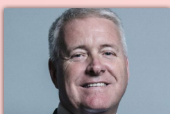
Ian Lavery Party Chair