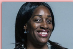
Kate Osamor International Development