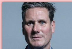
Keir Starmer Exiting the EU