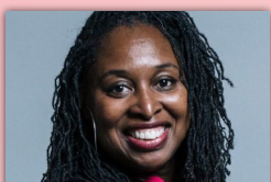
Dawn Butler Women and Equalities