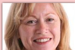
Baroness Smith Leader of the Lords