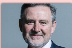
Barry Gardiner International Trade