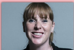
Angela Rayner Education