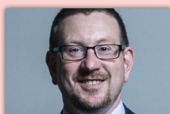
Andrew Gwynne Communities