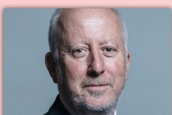
Andy McDonald Transport