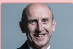
John Healey Housing