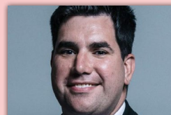
Richard Burgon Justice