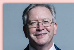
Peter Dowd Chief Secretary to the Treasury