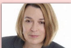
Barbara Keeley Mental Health and Social Care