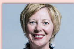
Lesley Laird Scotland