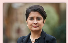
Shami Chakrabarti Attorney General