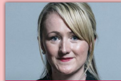
Rebecca Long-Bailey Business, Energy and Industrial Strategy