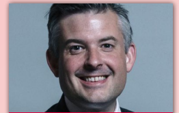
Jonathan Ashworth Health and Social Care