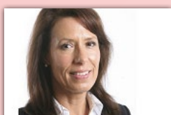
Debbie Abrahams Work and Pensions