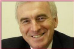
John McDonnell Chancellor of the Exchequer