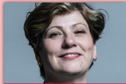
Emily Thornberry Foreign and Commonwealth Affairs