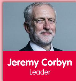
Jeremy Corbyn Leader