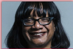
Diane Abbot Home Office