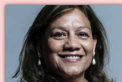
Valerie Vaz Leader of the Commons